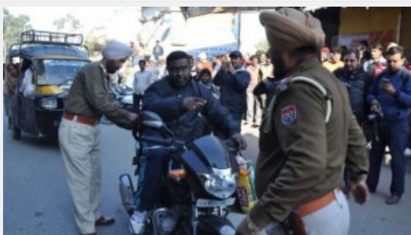
India's Punjab state is on alert following the attack

At least one explosion – suspected to have been caused by a grenade – was heard on Sunday. Local news reports said a soldier from a commando unit had been killed while defusing explosives.