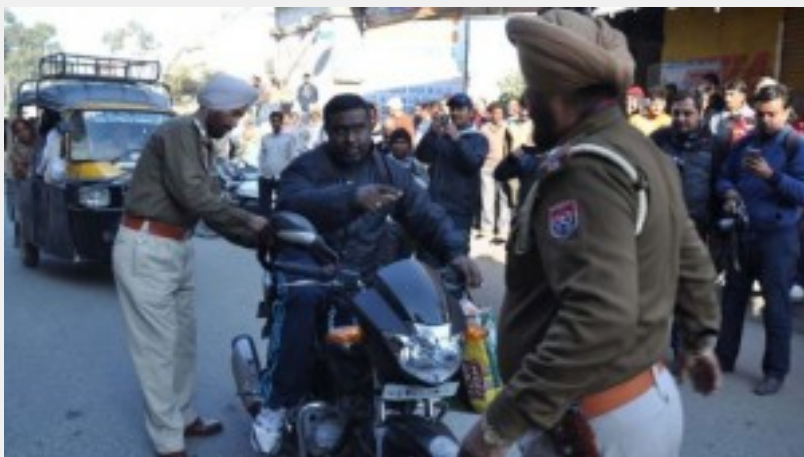
India's Punjab state is on alert following the attack

At least one explosion – suspected to have been caused by a grenade – was heard on Sunday. Local news reports said a soldier from a commando unit had been killed while defusing explosives.