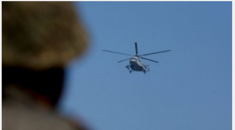
Helicopters have been involved in the operation to secure the base

Pakistan's foreign ministry and the US State Department have condemned the attack.