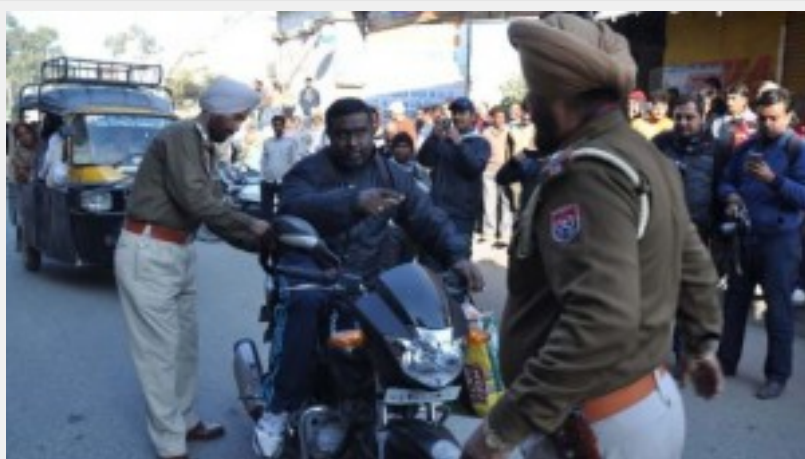
India's Punjab state is on alert following the attack

At least one explosion – suspected to have been caused by a grenade – was heard on Sunday. Local news reports said a soldier from a commando unit had been killed while defusing explosives.