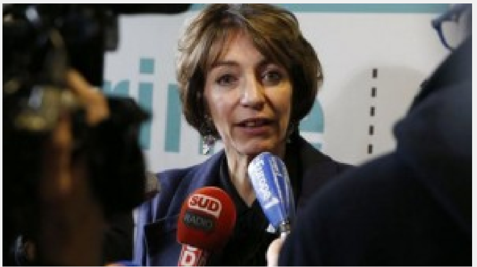
Health Minister Marisol Touraine is travelling to Rennes.

Marisol Touraine said there had been a “very serious accident” during a trial by a private laboratory in Rennes.