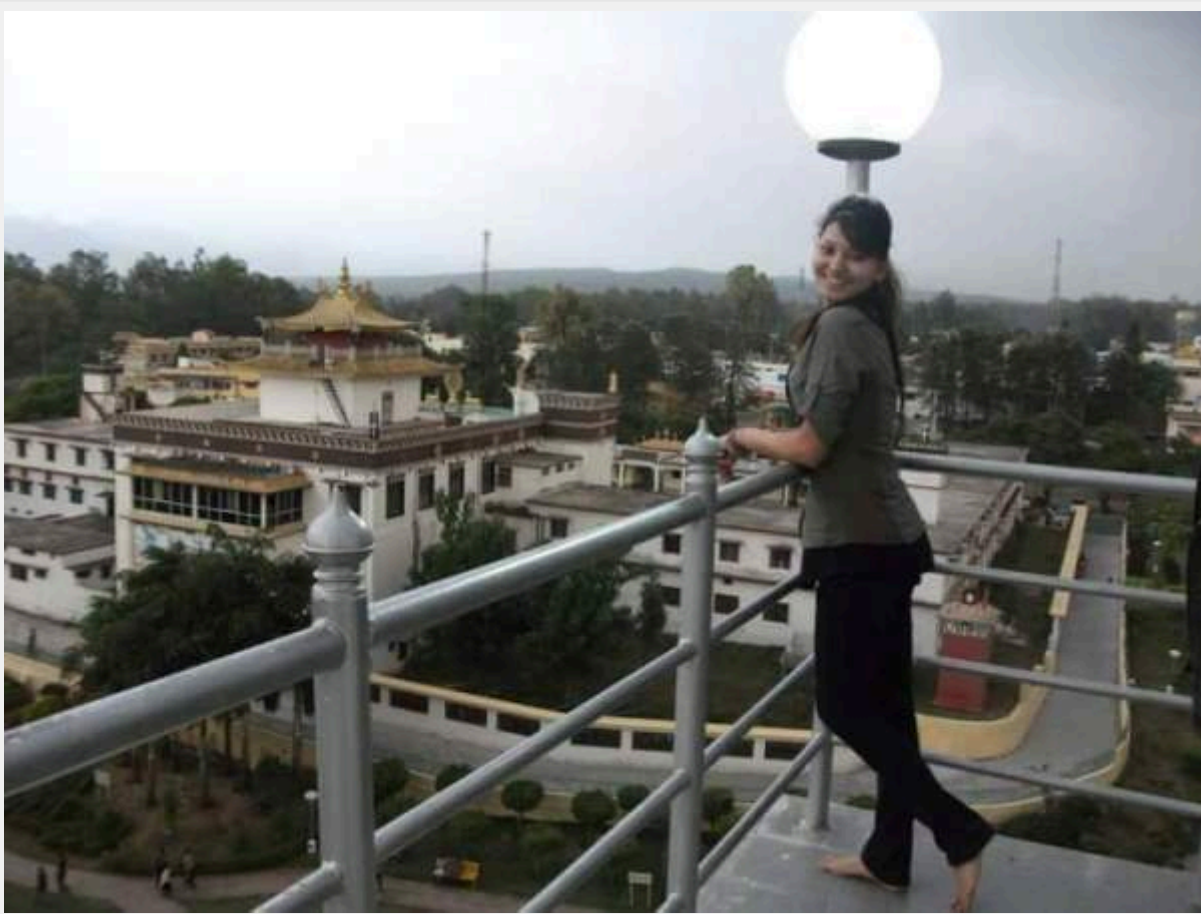
Urvashi Rautela/ Facebook

IITians, Miss Universe will be broadcasted live on 21st of December at 5:30 am. Best of luck waking up for that.