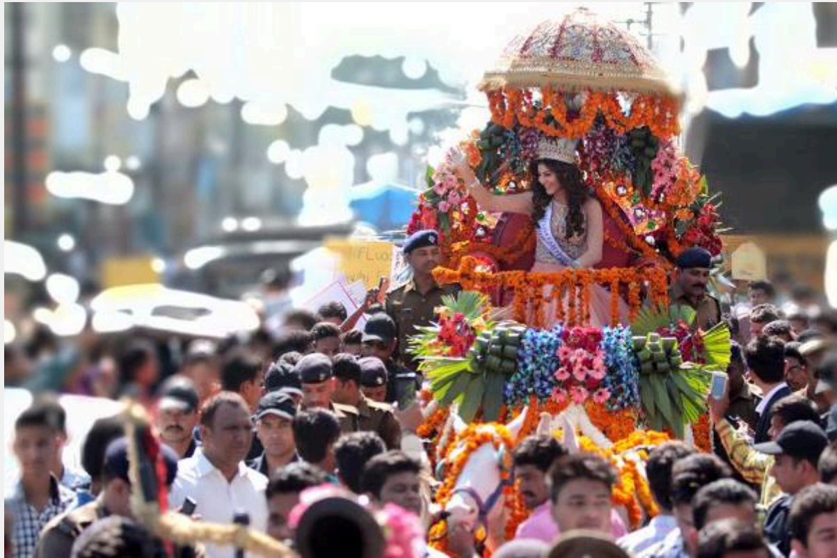
Facebook/ Urvashi Rautela

supporting India, she's making our nation proud", and so on and so forth. So if you're one of those, please ignore this because no matter what I say, your 'opinion' about me won't change.