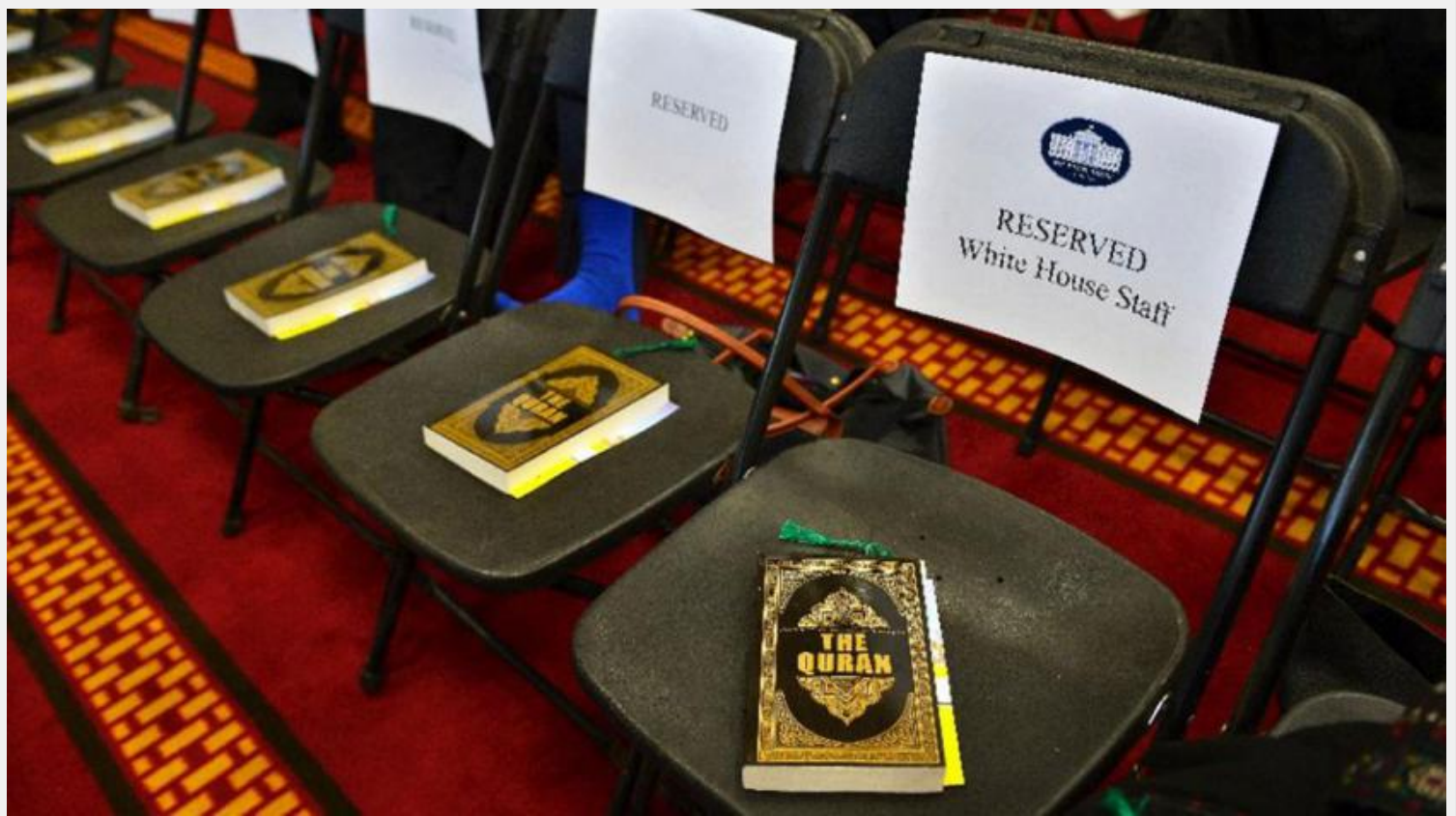
Copies of the Quran are seen on reserved chairs prior to a speech by US President Barack Obama at the Islamic Society of Baltimore on February 3, 2016 in Windsor Mill, Maryland

Obama took on such comments, and asked Christians to see “an attack on one faith is an attack on all our faiths.”