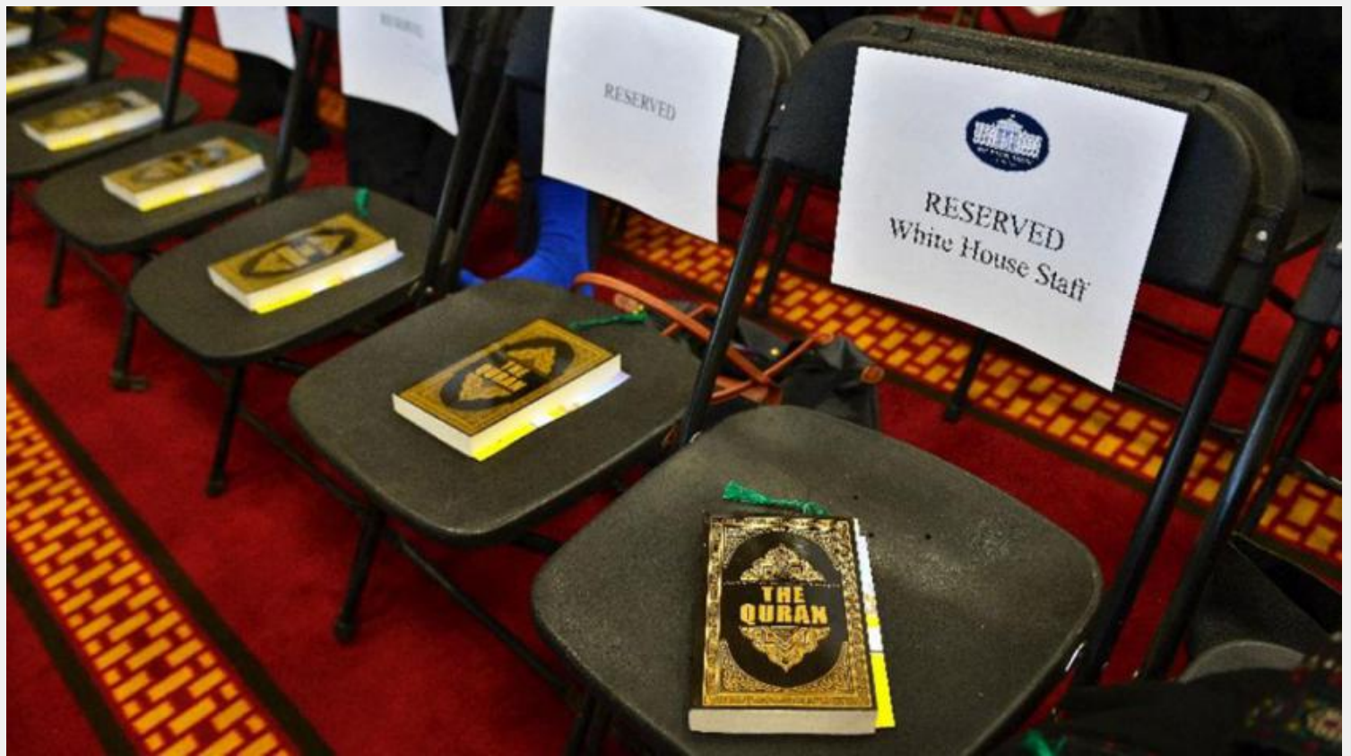
Copies of the Quran are seen on reserved chairs prior to a speech by US President Barack Obama at the Islamic Society of Baltimore on February 3, 2016 in Windsor Mill, Maryland

Obama took on such comments, and asked Christians to see “an attack on one faith is an attack on all our faiths.”