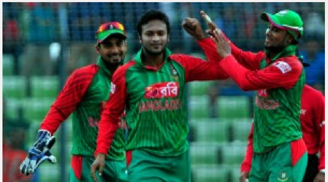
Bangladeshi ace all-rounder Shakib Al Hasan takes a wicket.

Whatmore said it was a closer contest than the result suggested but Zimbabwe would still be concerned by their current form.