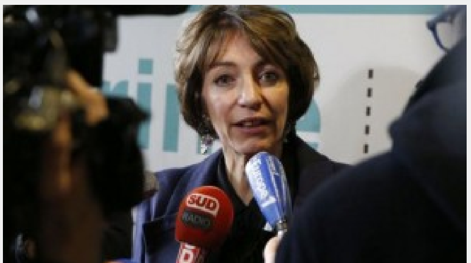
Health Minister Marisol Touraine is travelling to Rennes.

Six people are in a critical condition – including one in a coma – after clinical trial of new drug in France, the country’s health minister says.