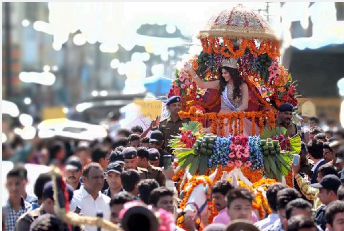
Facebook/ Urvashi Rautela

First things first, we all know that Urvashi is the girl who Honey Singh tries to heckle and woo outside a mall in the world famous song 'Love Dose'.